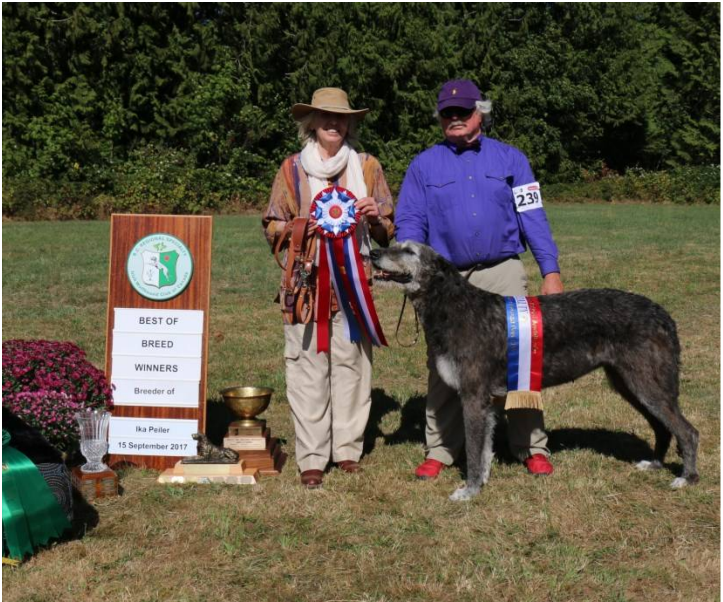
Rockhart Lestat ex Conchobar Jolie, Elsewhere