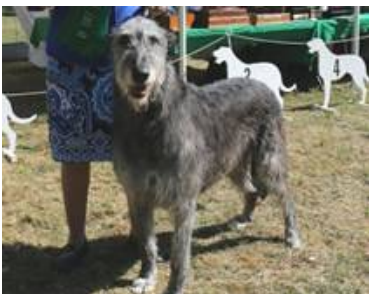
HAWHAVEN FIONN TAFFY (F), UY266073, 08-Dec. 08

Maya, my sill long limbed girl is now entering her majestic and regal phase. A quiet leader, she enjoys bunny chasing at her own pace and resting in the sun.