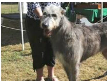
AUGUST MAYA (F), Listed, 17-May-09

I am proud to have Niagh here today, she is such a joy to live with, a very strong matriarch, grandmother and mother to many. She continues to rule the roost at Cnoccarne and we wish her many more years to good health..