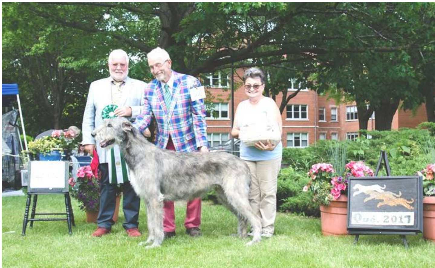
Lismore Stoneybrook Macheath ex Lismore Stoneybrook Nora